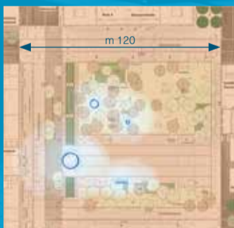
The pilot project is part of the heat reduction measures promoted by the City of Zurich and is being scientifically monitored by ZHAW.

The four-part installation at Turbinenplatz, Zurich (14,000 m 2 ), equipped with 300 nozzles, uses a water volume comparable to an average water fountain and features self-regulating automation with environmental sensors.