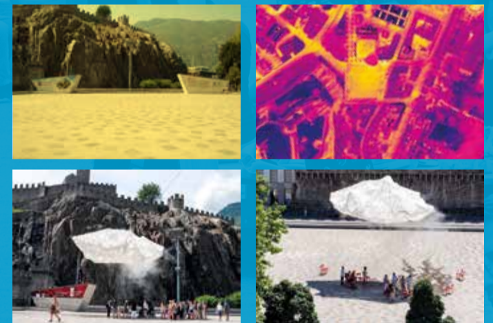
150 nozzles, hidden inside the cloud, create sufficient fog to cool the 3,600 m 2 public space.

The heat island in the heart of Bellinzona, where the cloud installation was positioned.