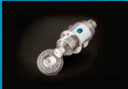
The Nephos Nozzle, equipped with a spiral vortex, is the result of collaboration between small Swiss companies rooted in the country's precision micromechanical tradition.

Obsessive research aimed at improving water mist technology make it possible to efficiently reduce the temperature and create a controlled microclimate with limited means and low consumption. In particular, the development of a reliable modular fog system and a uniquely designed and self-manufactured ultra-fine nozzle allows for perfect misting over many years of use. With the know-how accumulated during two decades of experience, Nephos masters the design, production and installation of fog systems.