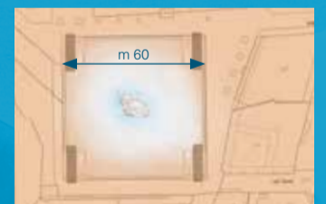
The installation was realised to celebrate the 150 th anniversary of AMB, Azienda Multiservizi of the Municipality of Bellinzona.