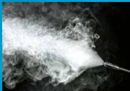
The Nephos Nozzle 3-100 nebulizes 2.6 litres of water per hour by 100 bar, consuming only 18 Wh of electricity.

The four-part installation at Turbinenplatz, Zurich (14,000 m 2 ), equipped with 300 nozzles, uses a water volume comparable to an average water fountain and features self-regulating automation with environmental sensors.